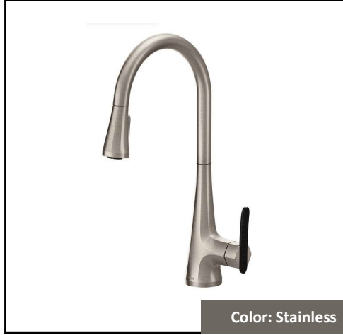
Moen Kitchen Faucet