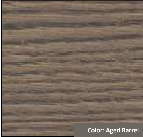
Oak Hardwood Flooring